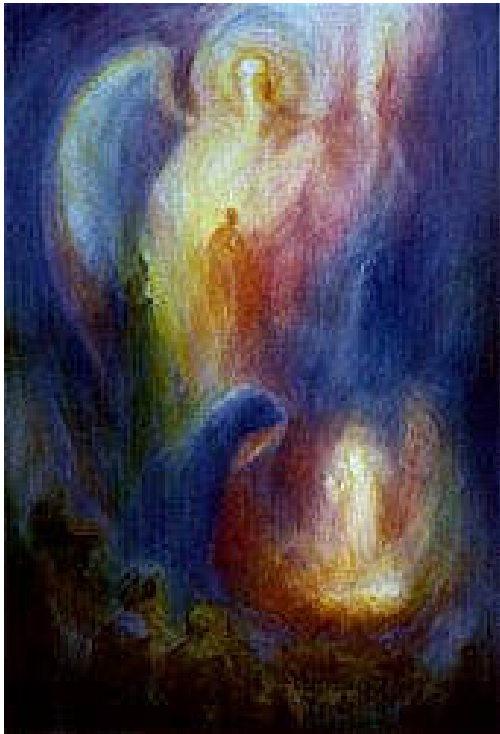
Nativity , by David Newbatt, Wynstones Press

So it is perhaps no overstatement if we express the following view: There is a lack of harmony in what our eyes perceive, when we wish to permeate ourselves with the Christmas mood, and wish to receive this Christmas mood from what we can see in today's environment. There is a discord in seeing the streets bedecked with Christmas trees and other decorations in preparation for the festival, and then seeing modern traffic rushing through the midst of it all. And if modern man does not feel the full extent of this discord, the reason may well be that he has disaccustomed himself to be sensitive to all the depth and intimacy which can be connected with this approaching festival.