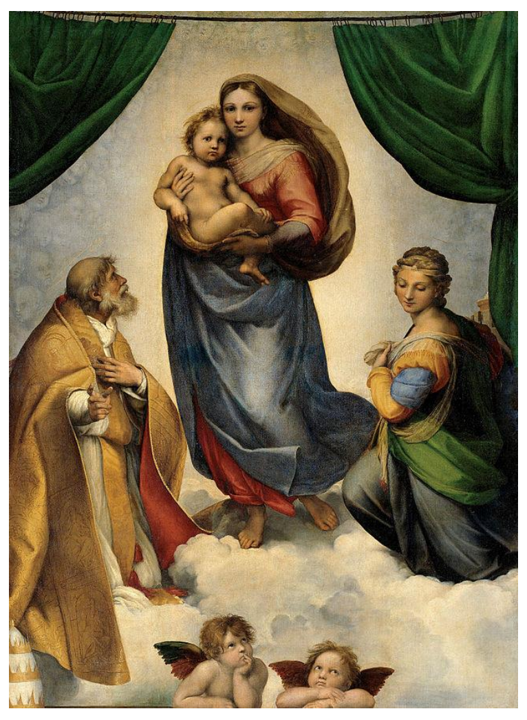
Raphael's Sistine Madonna, which according to Dr. Steiner is the picture that can arise out of all that we can feel at Christmas time.

A Newsletter of the Portland Branch of the Anthroposophical Society <a href="www.PortlandAnthroposophy.org">www.PortlandAnthroposophy.org</a> Volume 136, December, 2015