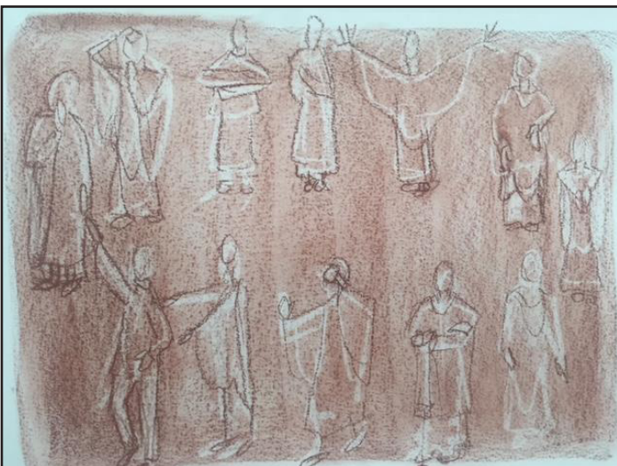
Sketch by Patricia of the eurythmists who were working on the Twelve Moods in 2017 in Portland

The verses written for the eurythmists are especially intricate. They are structured to relate to the 12 moods in the zodiac and their relationships to the planets, as