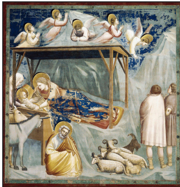
"Nativity" Giotto 1305

lecture yesterday I explained why a knowledge of Christ once enriched by the old clairvoyance was bound to recede, how it was received in the earliest periods of Christendom but then gradually waned and faded away. I will read, again to-day, an ancient Gnostic hymn from which it is clear that in the old, clairvoyant form of knowledge the consciousness was alive that the Christ Who came into the world through the Child born at Christmastime, is a Cosmic Being, increasing in majesty and greatness, the higher the soul's vision soars into the realms of spirit — for through these realms He descended. It was inevitable that in later times, when the springs of this knowledge had run dry, a veil should be drawn over the great Event, because men were no longer able to explain that in the secret represented by the Child, the highest wisdom is enshrined. In this Child was born a Being Who traversed the heavenly worlds before His appearance on earth. —