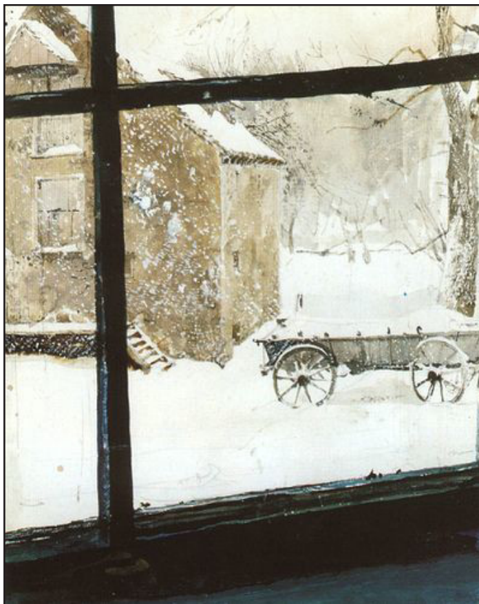
Watercolor by Andrew Wyeth