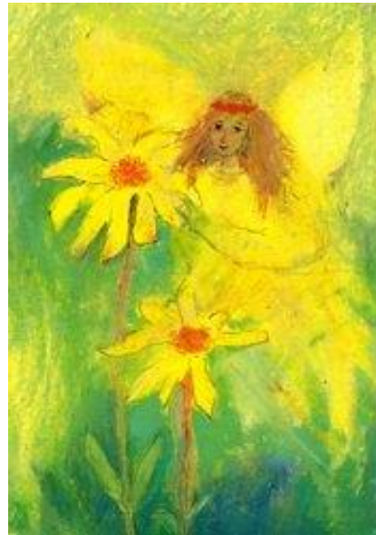
Elf With Arnica