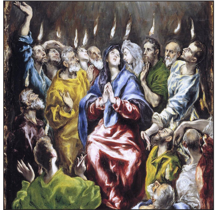
El Greco's Pentecostés, 1597

Dr. Steiner explains that “In the ancient times which preceded Christianity, little as yet was experienced of what can be called world-wide humanity, of that feeling of human fellowship which in ever greater measure has