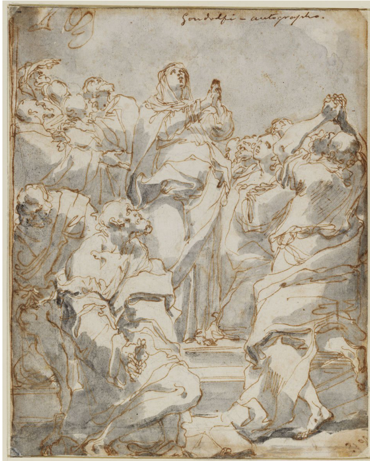
Gaetano Gandolfi 1766 Pen and Ink

Rudolf Steiner goes on to further describe this new Holy Spirit which imbued the disciples: “Through the