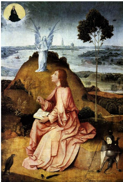
St. John on Patmos by Hieronymus Bosch Circa 1489