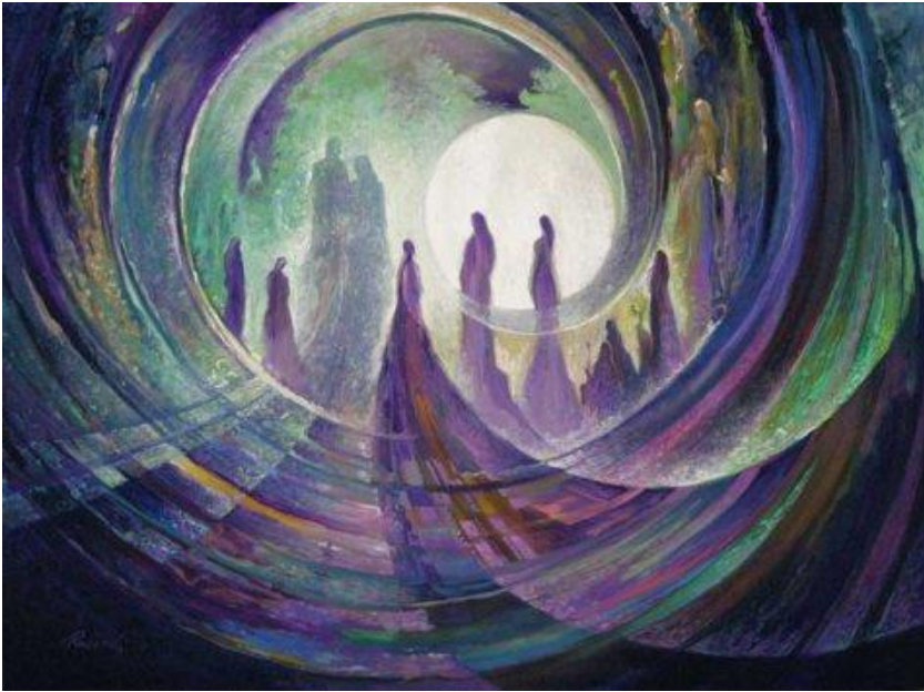
Meeting Relatives, Friends and Karma over the Threshold