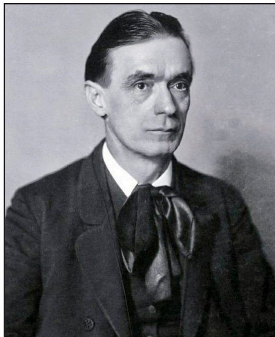
Rudolf Steiner 1911