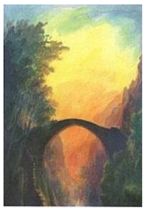
The Bridge, by David Newbatt Available from Wynstones Press