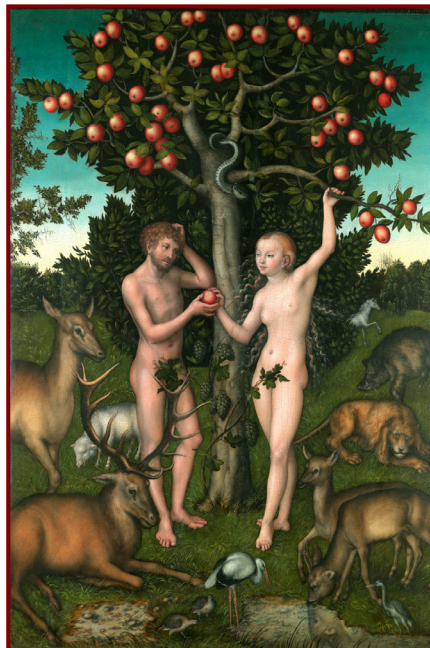
Lucas Cranach the Elder (1472-1553), Adam and Eve

If the picture you have of yourself does not include a reincarnating individuality, then the powerful realities of race, nationality, gender, and sexual orientation easily become your main identity-determining factors. However, there are individuals who are quietly and undemonstratively exploring how their experience of gender, sexuality and orientation belong at the highest spiritual level to the exhortation: "Know Yourself". To know that the most essential human part of us is beyond gender, to recognise the same in another individuality whatever their gender, and then in some cases to realise a mutual longing for physical intimacy together irrespective of gender, are experiences that arise where there is no initial erotic expectation in the encounter. This quality of human communion is of course available to everybody, but it is of particular interest when considering the significance of gender, gender fluidity and gender dysphoria. Such ego-to-ego recognition in which sexual identity, gender consciousness and orientation no longer play traditionally determining roles, affirms the universally human, not just beyond ethnicity, religion and culture, but also beyond gender.